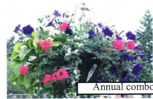
Annual combo-delivery size

Boisterous Cottage Mix ~ (see photo top of order form for an example of how this will look) A blend of perennials and self-seeding annuals for a happy year-after-year display in shade of sunny yellow, clear pink, violet and white. 3 each Rudbeckia "Goldsturm", Liatris "Blazing Stars", Delphinium "Galahad" in 3" pots and 2 packs each of Cosmos Sensation mix (12 plants) and Alyssum "Easter Basket Mix" (12 plants). 33 plants for $25.00